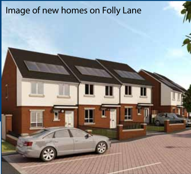
Image of new homes on Folly Lane