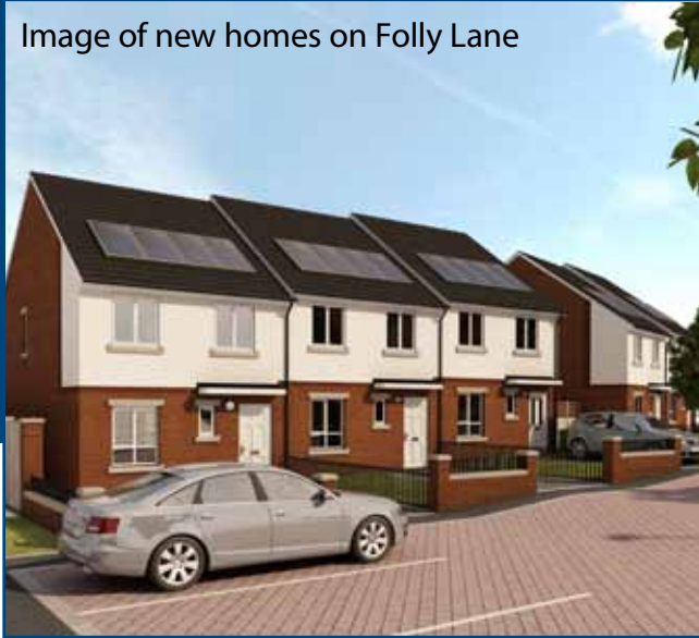
Image of new homes on Folly Lane